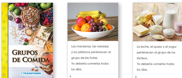
"Food Groups" book

Spanish resources in enCORE are offered through the enCORE Whole Child Advance Package.