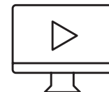
Book Read-Aloud Videos

Each literature book has 4 corresponding worksheets in Spanish, including vocabulary flashcards and leveled comprehension worksheets. Check out samples below!