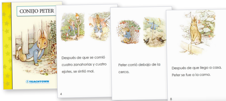
"Peter Rabbit" book